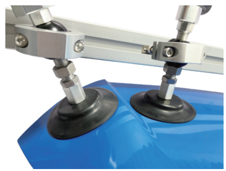
* HAUG case