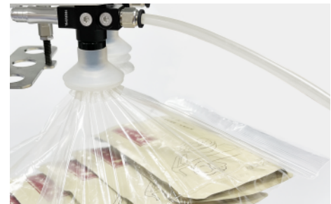
*HMX examples of handling soft bags